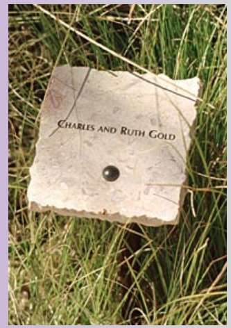
Bench Marker, Heart of Africa, San Diego Wild Animal Park